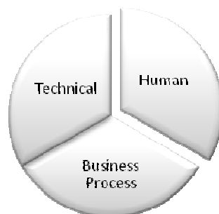
Figure 1: Business Agility Framework Components

Business agility means fast reaction to change and the ability to rapidly implement changes. Business agility needs to be holistic in scope [14]. Figure 1 presents business agility framework core components. Business agility consists of three interoperable components: Human, Business Process, and Technical agility. Humans are assumed to be agile in management and operations for the enterprise to be agile. Human agility is the main enabler of business agility. Business process agility has gone long road till it reached BPM [19]. BPMS is the enterprise information system that realizes BPM. Technical agility, that addresses IT infrastructure and information systems architecture, can make use of SOA. Aligning BPMS and SOA can enhance business agility.